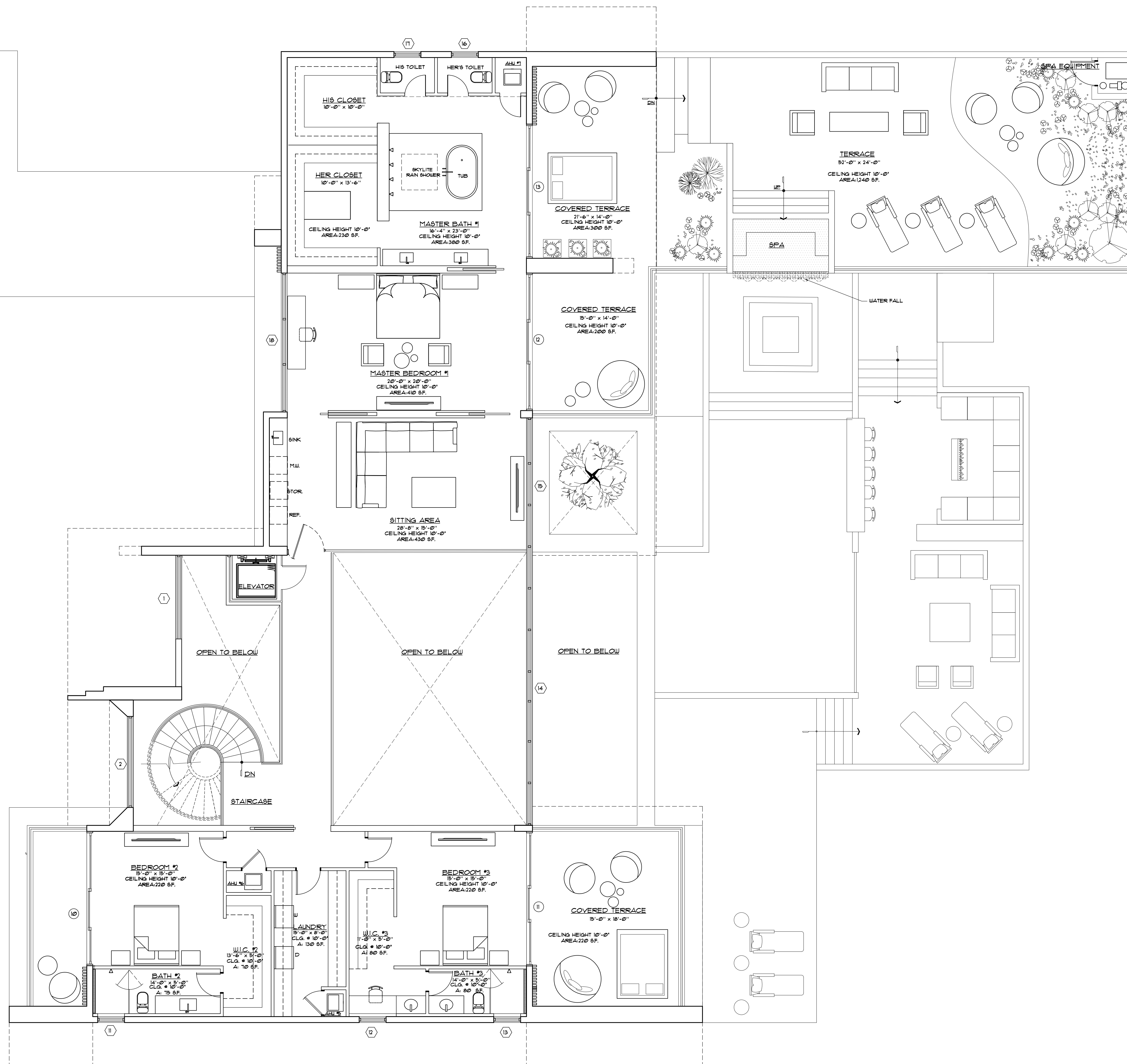
SECOND FLOOR PLAN SCALE: 3/16" = 1'-0"

PROPOSED RESIDENCE FOR: MODERN GARDENS PROPERTY ADDRESS: DELRAY, FLORIDA